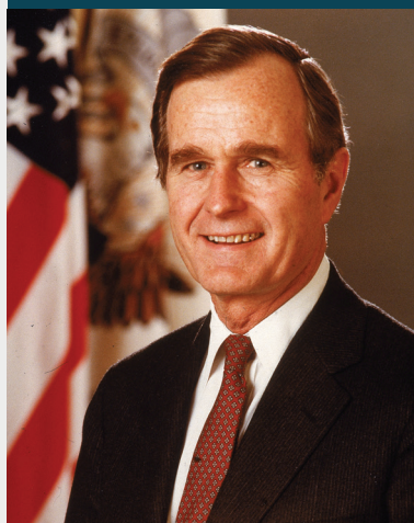
George HW Bush was President of the United States from 1989 until 1993. He declared a 'new world order' at the end of the Cold War as he announced a USled military action against Iraq following its invasion of Kuwait. President Bush steered the US into the beginning of a new unipolar era and committed the US to continued involvement in international affairs.