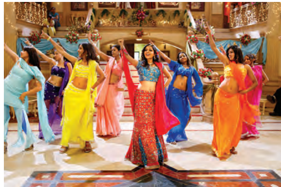
Figure 7.16 Different national cinemas have different codes and conventions. Unless you have the background knowledge, your reception of foreign films may be minimal. For instance, a musical segment appears in almost all Bollywood films irrespective of the genre. Even action or crime genres can have musical breaks.