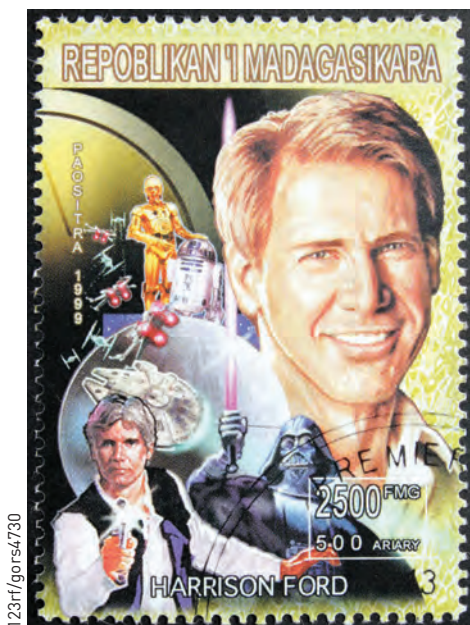
Figure 7.8 Actor and film producer Harrison Ford portrayed on a postage stamp from Madagascar. The stamp depicts aspects of Ford's star image: previous screen roles, the person himself and his awards.

John Wayne, an actor in many classic Westerns, is an example of a star that stands for something much larger than himself. As well as being himself, with all his own very human failings, he came to represent an ideal of American manhood in the 1940s through to the 1960s. He appeared to be a tough, pioneering man with a keen eye for justice. He could shoot, ride horses and do all of those essentially 'manly things'. This was performed for an audience whose own reality was very different – they were often office-bound and suburban. When John Wayne appeared in a film, he brought his special meanings as a sign to his roles, thus adding more to these characters than was written in the script.