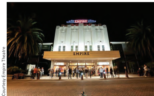
Figure 7.11 The Empire Theatre, Toowoomba, was built as a movie theatre and showed films until 1971. The movie theatre was originally part-owned by E.J. Carroll, who later founded the cinema chain Birch, Carroll & Coyle. Before the arrival of television in Australia in the 1950s, and the arrival of the multiplex in the 1970s, movie theatres commonly presented themselves as 'picture palaces'. This sense of luxury promoted movie-going as a special event. Viewing a film in this context was a heightened audience experience.

with ornate decorative features. Heavy brocade curtains reinforced the feeling that watching a movie was a great event. Of course, like a Hollywood film set, much of this ornate decoration was one-dimensional and fake, made from plywood, plaster and chicken wire.