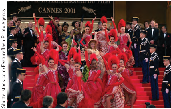
Figure 7.15 Can-can dancers from the Paris Folies Bergère at the premiere of the Baz Luhrmann film Moulin Rouge! (2001). Popular songs from a number of different eras have been included in the soundtrack of this musical. When the audience hears them, their background knowledge, memories and associations are triggered.