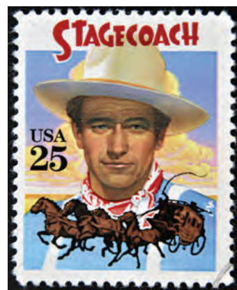
Figure 7.7 A stamp featuring John Wayne and the name of the Western movie that made him a star – Stagecoach (1939). John Wayne, the actor, stood for an idealised version of American manhood from the 1940s until the 1960s. In this sense, he also operated as a semiotic sign. Whenever he played a role, he filled that character with his own meanings as a star.