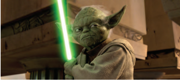
Figure 7.4 Yoda in Star Wars: Episode III – Revenge of the Sith (2005). In a Star Wars movie, no one would expect a character to use handguns instead of light sabers. Even though handguns have real-world or external reality, they do not have narrative or internal reality: handguns would not be consistent with the story world.